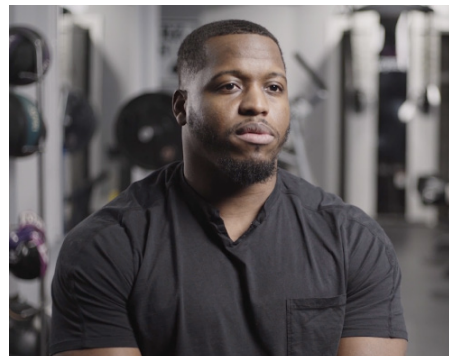
JONATHAN STEWART Former Carolina Panthers: Running Back