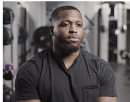
JONATHAN STEWART Former Carolina Panthers: Running Back