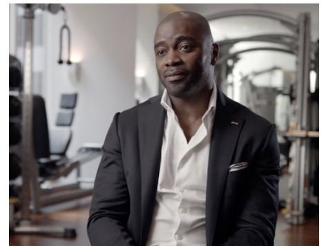
CURTIS MARTIN Former NY Jets: Running Back