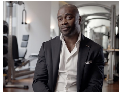
CURTIS MARTIN Former NY Jets: Running Back